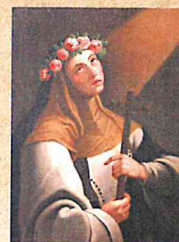
St. Rose of Lima August 23rd