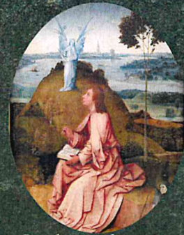
Hieronymus Bosch, St. John on Patmos . c. 1489 December 27: St. John, Apostle and Evangelist