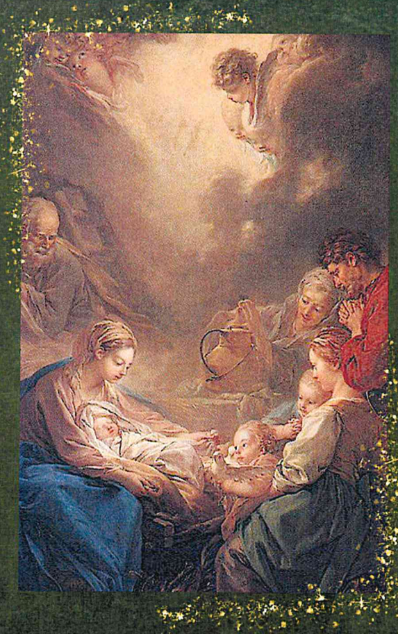
François Boucher La Lumière du monde 1750

919 E. Indiana Ave. Coeur d'Alene, Idaho P. 208.664.9259 | W. stthomascda.org