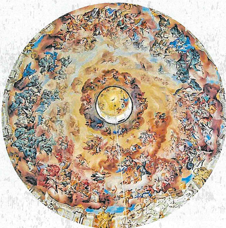
Frescos de la cupula principal en la Abadía de Ettal en Baviera, Alemania

919 E. Indiana Ave. Coeur d'Alene, Idaho P. 208.664.9259 | W. stthomascda.org