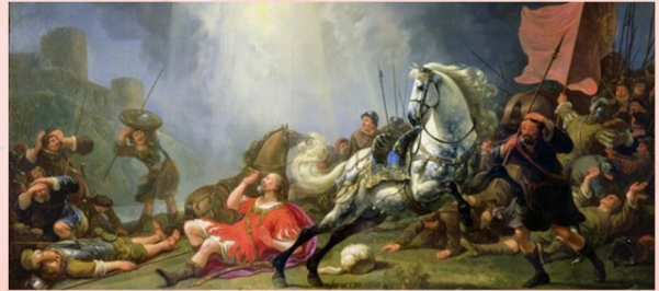
Cuyp, Aelbert. Conversion of Paul on the Road to Damascus. 1650