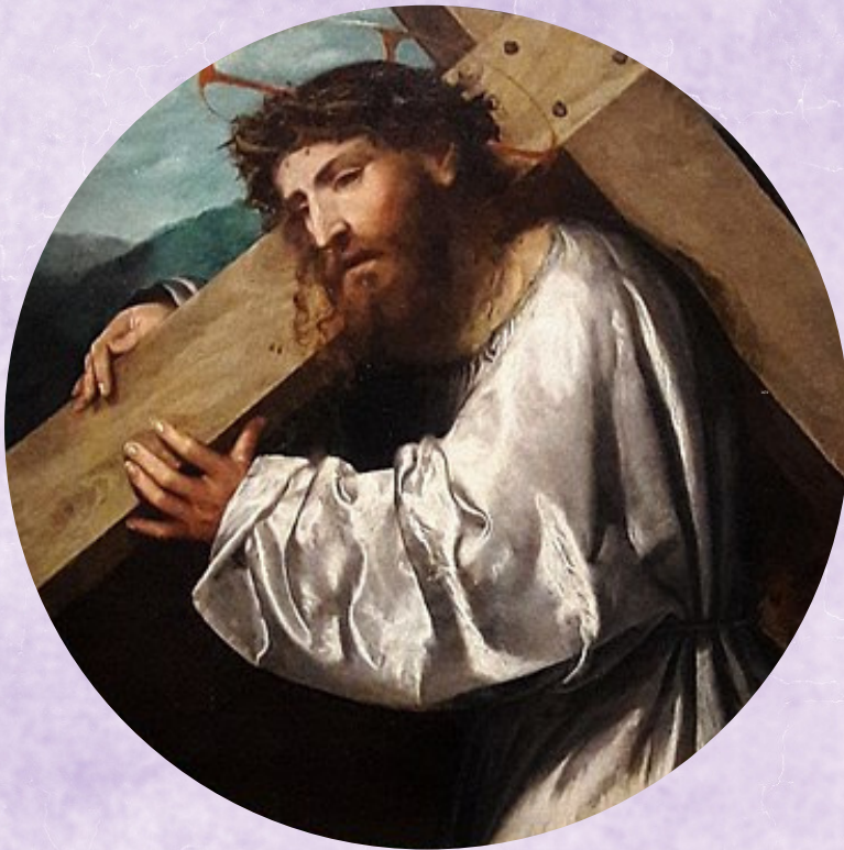
Romanino, Girolamo. Christ carrying the cross . c. 1545

919 E. Indiana Ave. Coeur d'Alene, Idaho P. 208.664.9259 | W. stthomasda.org