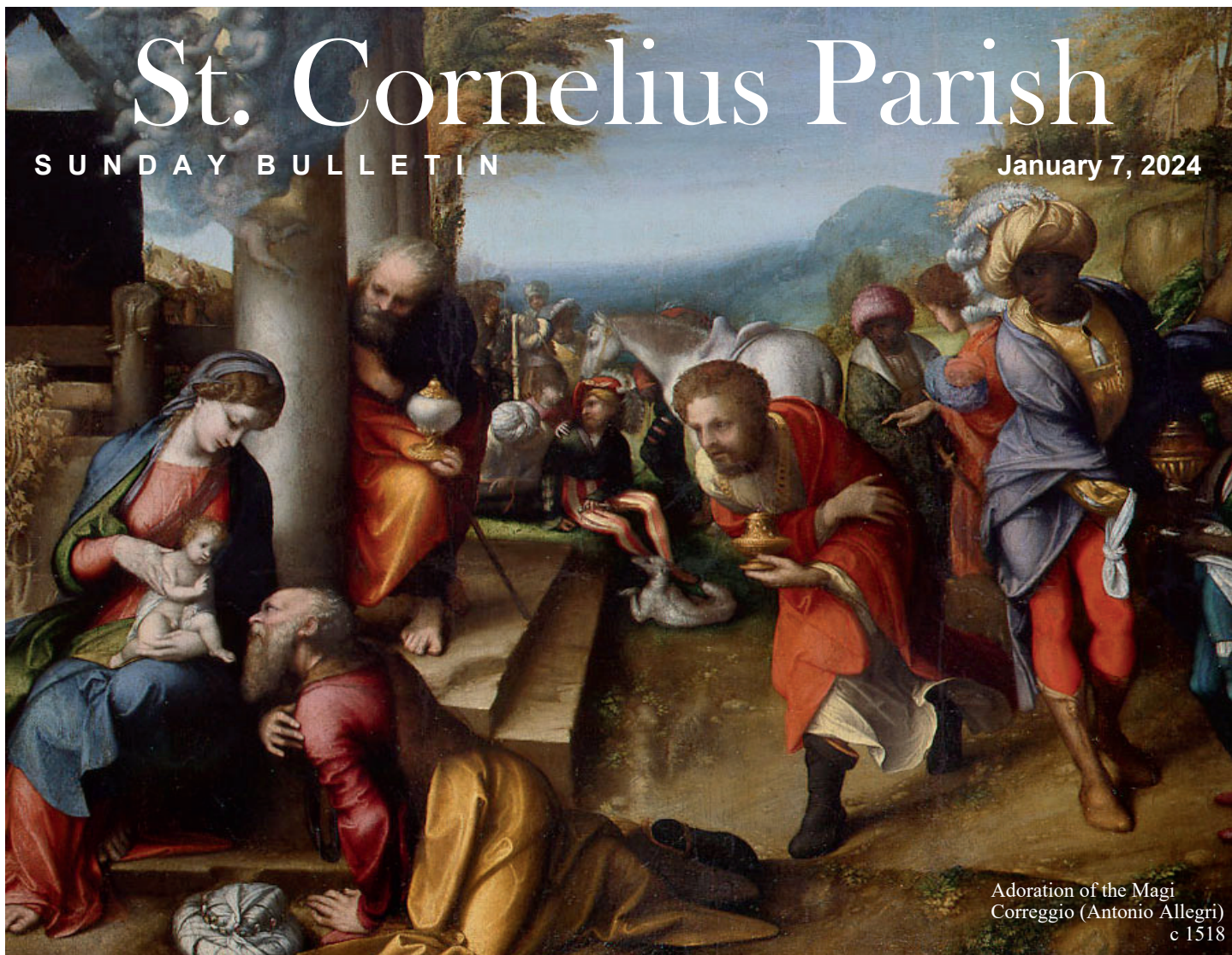
Adoration of the Magi Correggio (Antonio Allegri) c 1518

160 Ridge Rd Chadds Ford, PA 19317 Phone: (610) 459-2502 Fax: (610) 459-3942