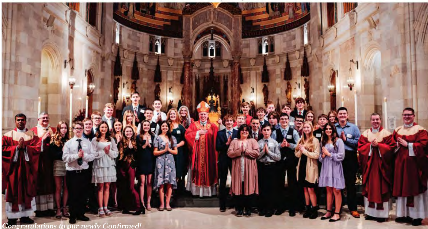
Congratulations to our newly Confirmed!

The CATHOLIC PARISHES of SANDUSKY To seek and to show the face of Jesus Christ.