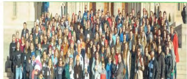
Attending the March for Life is life-changing for high school & college students