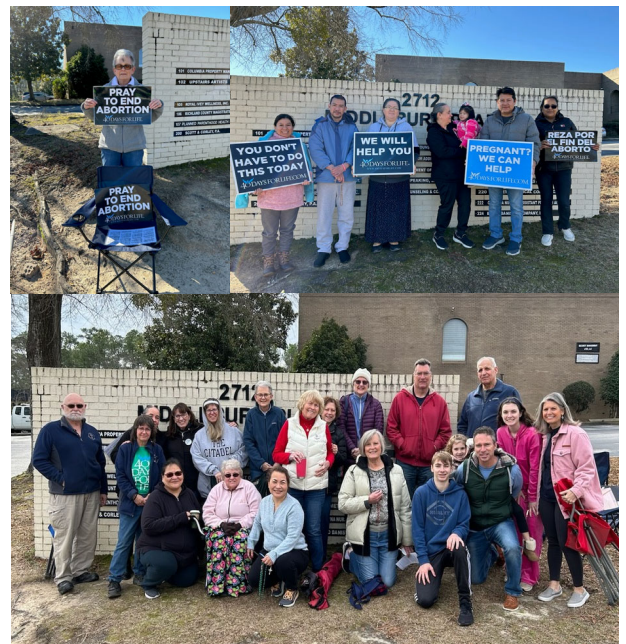
Praying in support of 40 Days for Life at Planned Parenthood