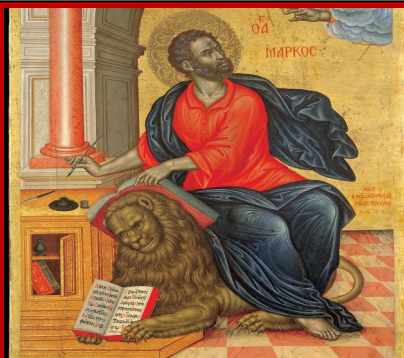
St. Mark, Evangelist April 25