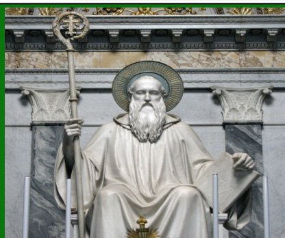
St. Benedict, Abbot July 11