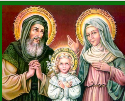
Nativity of the Blessed Virgin Mary September 8