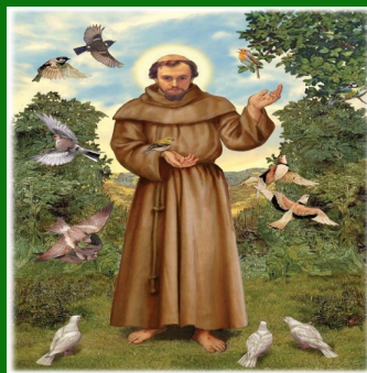
Feast of St. Francis October 4