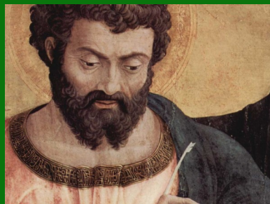
St. Luke, Evangelist October 18