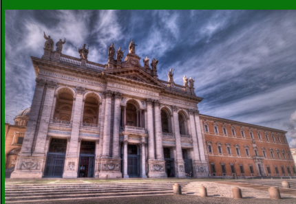
Dedication of the Lateran Basilica November 9