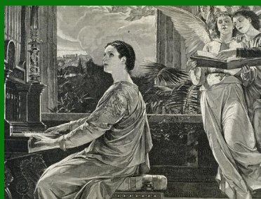
St. Cecilia, Virgin and Martyr November 24