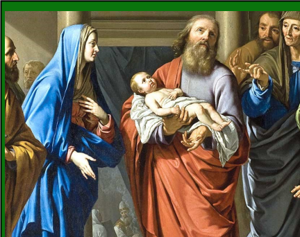
The Presentation of The Lord February 2