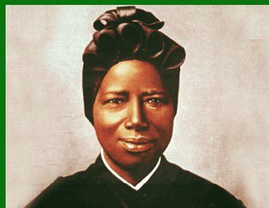
St. Josephine Bakhita February 8