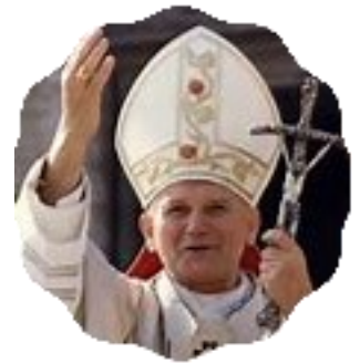
Pope John Paul II

"Be apostles of Divine Mercy under the maternal and loving guidance of Mary."