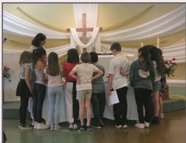
Children at their retreat learning all about the Eucharist and table setting.