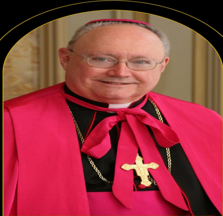
Ordained on June 29, 1975 by Pope St. Paul VI