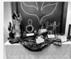
Family Lent Project

By the end of Lent we will be a little more like Christ Himself who sacrificed perfectly for each of us, is always eager to hear us in prayer, and never failed to help those who needed Him.