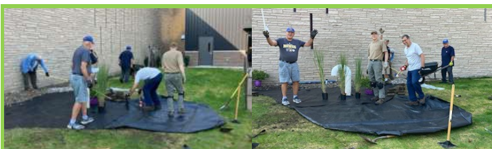
Beautiful Landscaping done by the Men's Club! Thank You!

We are Thankful for our Advertisers! Please support them!