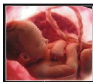
Photo taken from Illinois Right to Life's brochure The First Nine Months

7th Month - "I like to listen to my mommy's voice!"