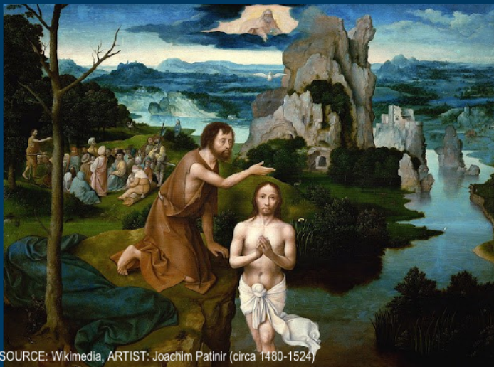
ARTIST: Joachim Patenir (circa 1480-1524)

FROM: The Catechism of the Catholic Church, Second Edition , #536