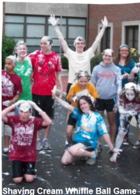
Shaving Cream Whiffle Ball Game

7th-12th graders 7pm-9pm Sunday-Thursday: