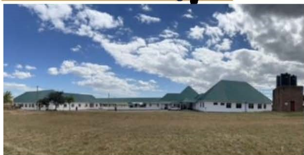
INUKA Recent Construction (14,500 Sq. Ft.) – Therapy Building (Left); Outpatient Clinic (Right)