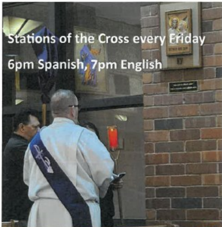
Stations of the Cross every Friday 6pm Spanish, 7pm English