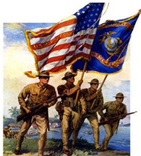
Let their remembrance be as lasting as the land they honored Daniel Webster