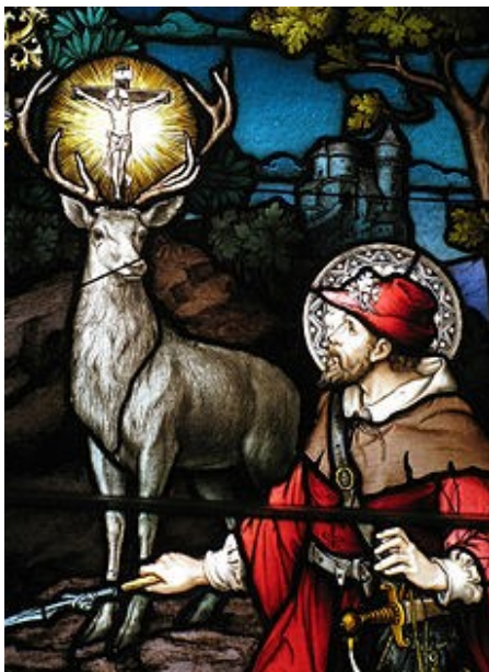
Saint Hubert (Franz Mayer & Co., St. Patrick's Basilica, Ottawa, Canada)

Worldwide Marriage Encounter Experience: Jesus' response to the hypocrites is an invitation to all of us into discernment. Give to God what is God's and to Cesar what is Cesar's. We live in a world with many demands on our time, talent and our money. We have family obligations, work obligations, personal ones and for many of us parental ones. The Marriage Encounter Experience facilitates an exploration of this delicate balance. It offers tools to discuss and prioritize without being dogmatic. The most important answers are often inside us if we can only unlock the words to speak them with compassion and clarity. Explore this gift of our Church and the weekend Experience. The next Marriage Encounter Experience will be at the Ranch in Ucross, WY, November 3-5. To learn more about the Experience, watch: https://www.facebook.com/watch/?v=635747607124827 OR visit the website: wwme.org OR apply today by calling 307-215-9444