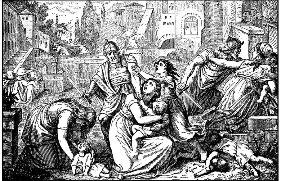
THE COVENTRY CAROL [16TH CENTURY]

A carol for the feast of the Holy Innocents