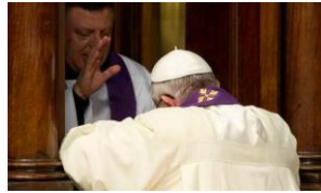
SACRAMENT OF RECONCILIATION DRIVE - THRU