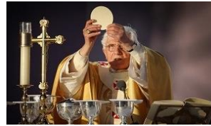
THE MASS LIVE STREAMED