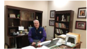
MEETINGS - VIDEO CONFERRING ZOOM