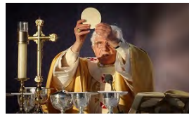
THE MASS Sat vigil - 5:00 PM (school parking lot) Sunday - 9:00 & 11:00 Weekday - 9:00 Am (Mon - Sat)