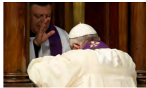
SACRAMENT OF RECONCILIATION 3:30 - 4:30 Saturday