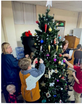
Photo from Light up for Christ