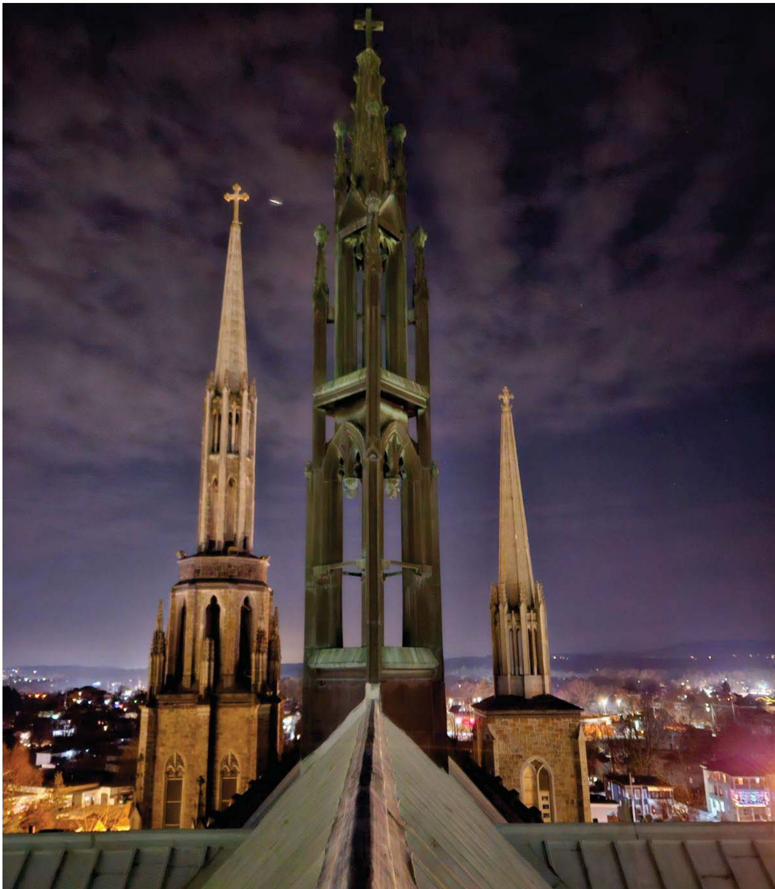
SAINT CECILIA'S CHURCH