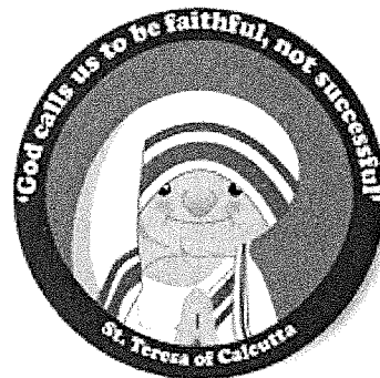
St. Teresa of Calcutta