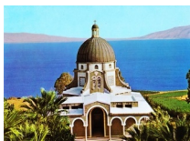
Church of the Beatitudes on the Sea of Galilee

Eastern Europe: (April 2016), Our Lady of Guadalupe: (June 2016), India: (Sept. 2016)