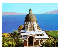
Church of the Beatitudes on the Sea of Galilee

Eastern Europe: (April 2016), Our Lady of Guadalupe: (June 2016), India: (Sept. 2016)