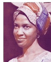
Sr. Thea Bowman