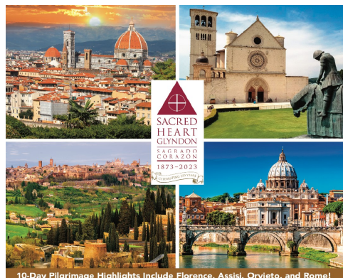
10-Day Pilgrimage Highlights Include Florence, Assisi, Orvieto, and Rome!