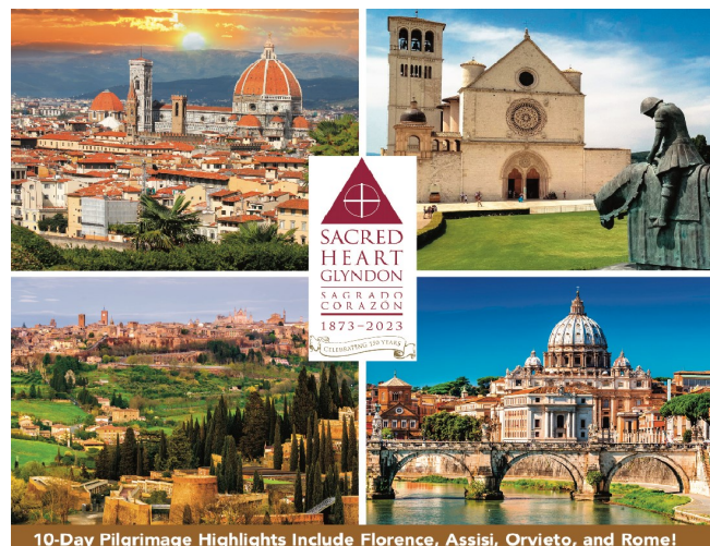
10-Day Pilgrimage Highlights Include Florence, Assisi, Orvieto, and Rome!