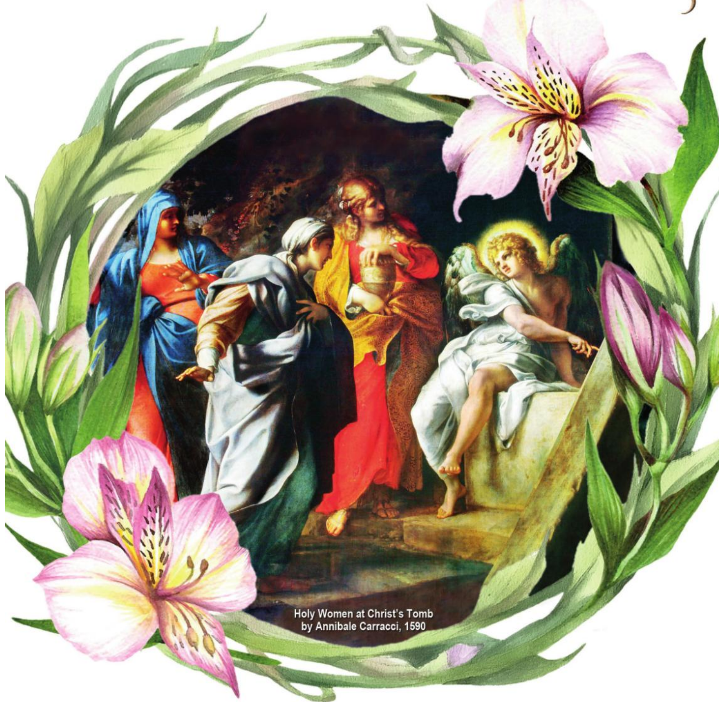
Holy Women at Christ's Tomb by Annibale Carracci, 1590

“Why do you seek the living one among the dead? He is not here, but he has been raised. ”