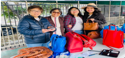
Parking lot sale