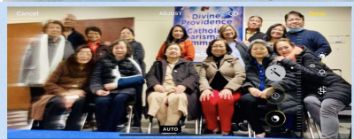
A blessed anniversary Divine Providence Prayer Group