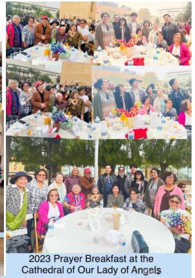
2023 Prayer Breakfast at the Cathedral of Our Lady of Angels