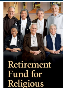
Retirement Fund for Religious

Your gift provides vital support for senior Catholic sisters, brothers and religious order priests. Thank you for your donations.