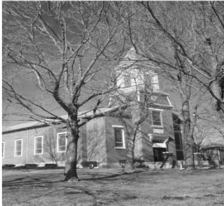
ST. JOACHIM CATHOLIC CHURCH 10120 Crest Rd Old Mines, Mo. 63630