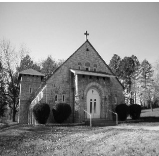
ST. JOSEPH CATHOLIC CHURCH TIFF, MO