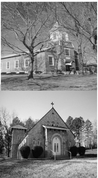
ST. JOACHIM CATHOLIC CHURCH 10120 Crest Rd Old Mines, Mo. 63630