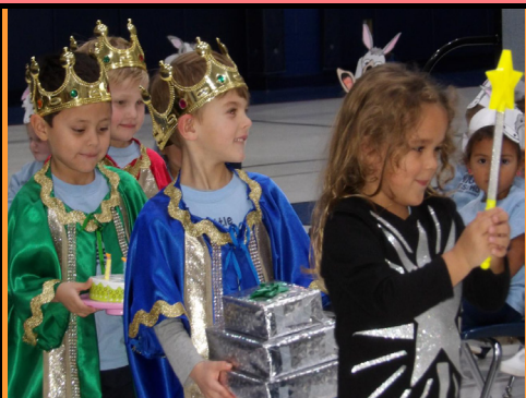
(Little Knights Preschool Bringing Gifts to Baby Jesus)