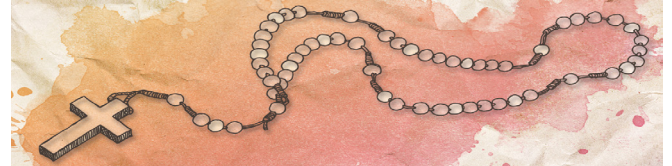
3RD SUNDAY IN ORDINARY TIME