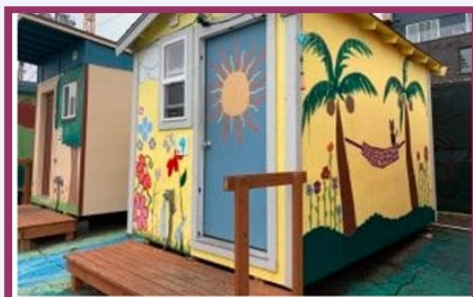
Artists and volunteers decorated the tiny houses in Seattle's Lake Union Village, situated on a parking lot owned by the City of Seattle.