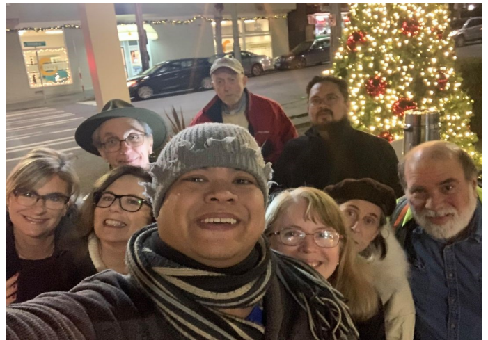
Spirit Choir Caroling in Madrona

We acknowledge that this is a very unique year for us as we merge parishes with St. Mary's and hopefully join forces and share music together. Everyone is welcome, and we look forward to learning from each other. It will be wonderful to see each other and begin to make music week by week together. May God bless us in that effort.