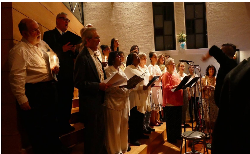
Combined Choirs at the Easter Vigil